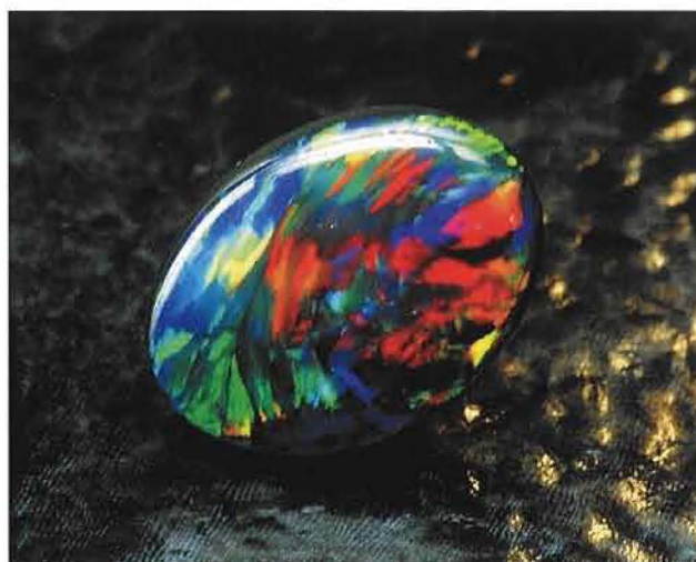
Exceptional gem opal

The criteria applied to colour assigns points according to the opal face, body tone, play of colour, brightness, pattern, directionality and special attributes.